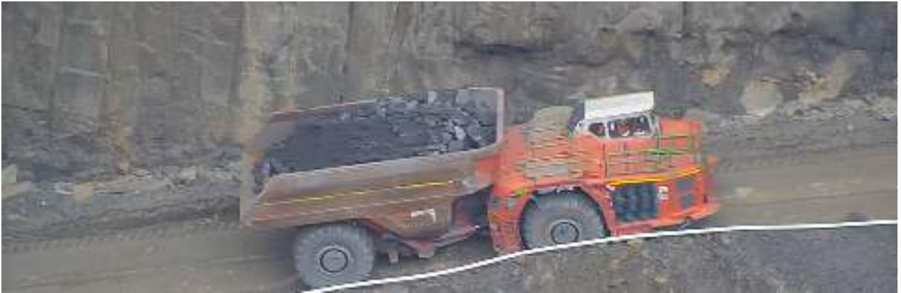
Figure 6 First crushing campaign as part of dry circuit commissioning