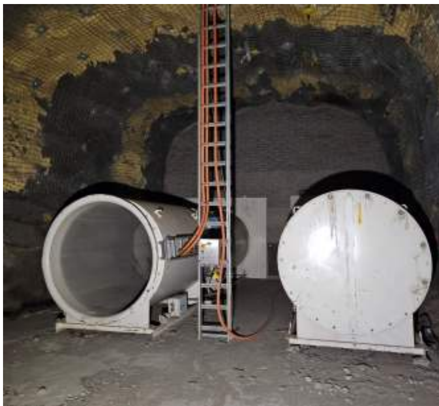
Figure 2 Secondary means of egress established, enabling stoping to commence