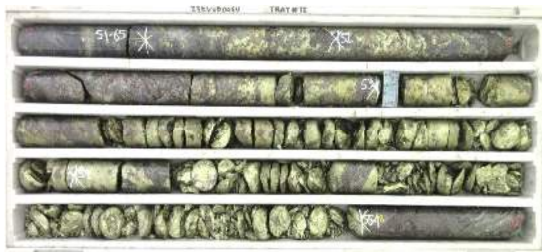
The interval 51.65m to 55.1m shown in this photo is an average of 3.45m @ 19.91% Cu