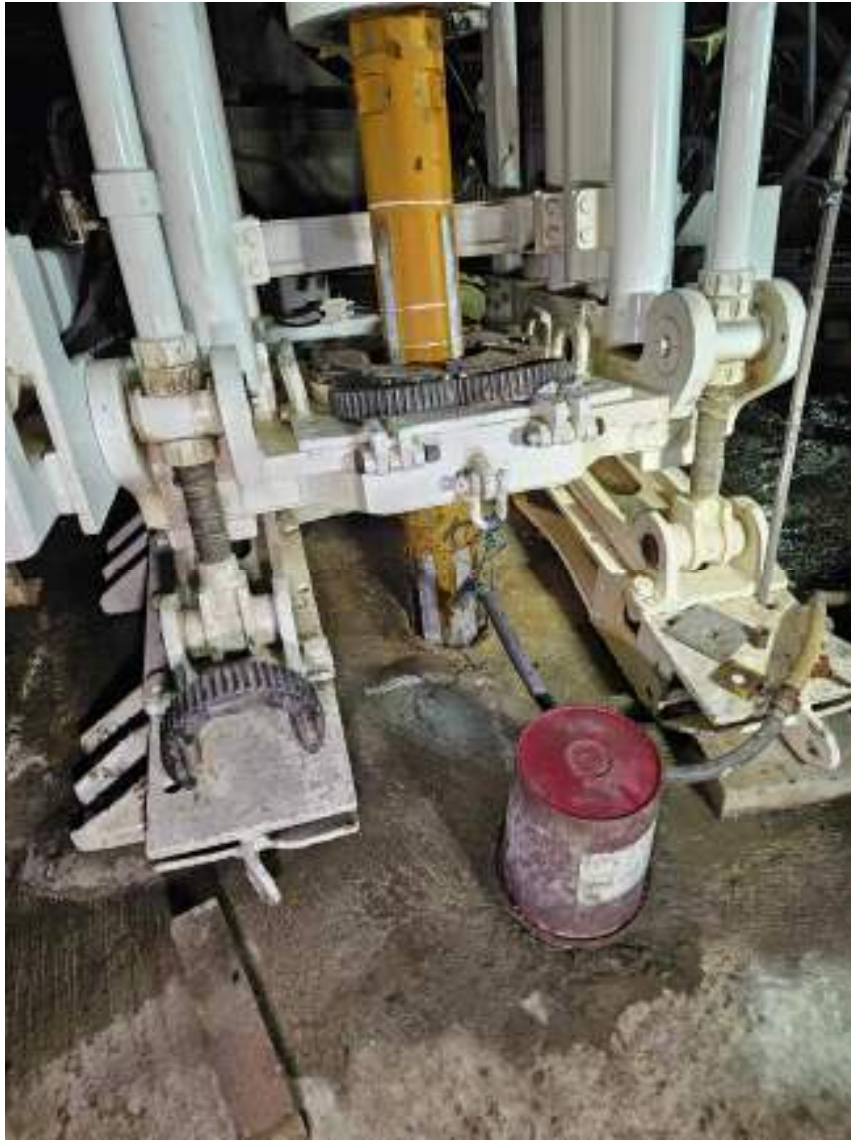
Figure 4 Drilling the first stope (LHS) and drawpoint after firing